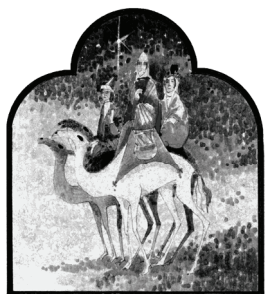
Magi from the east arrived

Did you know that the only reason we say that there were three Wise Men is that they brought three gifts? The Bible never mentions their number or their names. The gifts tell us about the givers. And these special gifts--gold, frankincense, and myrrh--tell us much.